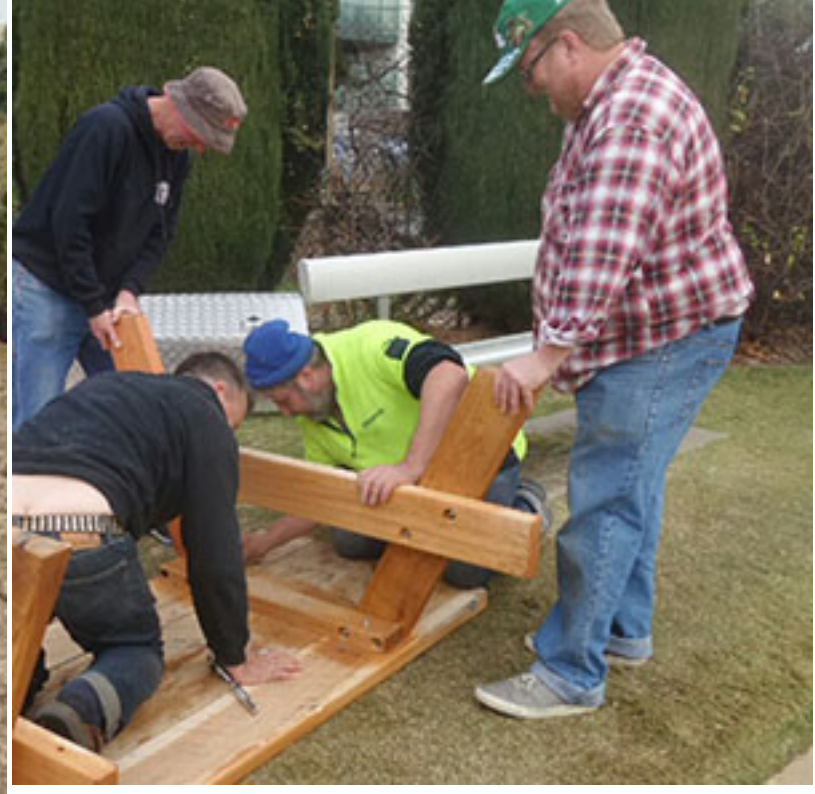
2 Dogs, Lucas Grousy [=BOD] & Whitey at work on the tables