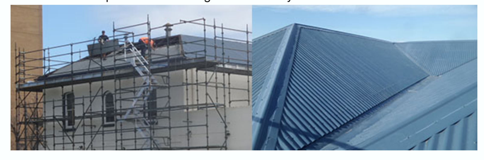
Getting ready for handover to Domain&Co 130 Union St is undergoing major upgrade. removal of asbestos, new stove, benches, new roof over back half, new