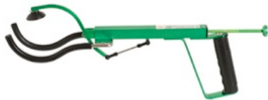
'Squeeze or pull release for a wheelchair'