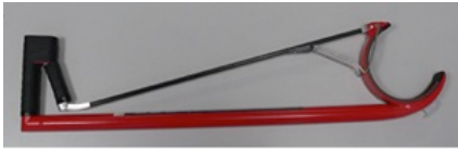
'The DHB Bowlers Arms - red'