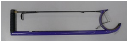
'The DHB Bowlers Arms - purple - fibreglass'