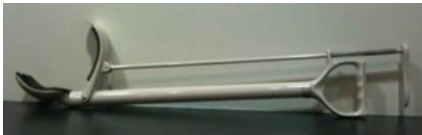
'The Bowling Arm'

You can purchase a bowlers arm through the network of retailers listed on the Bowls Australia website by clicking through to retailers .