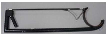
'The DHB Bowlers Arms - black'